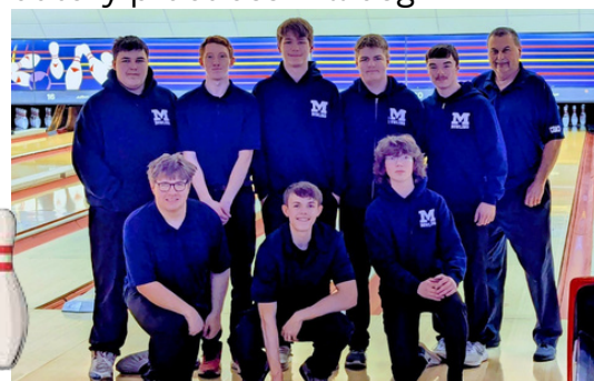
The boys' bowling team posing with their coach for a team picture