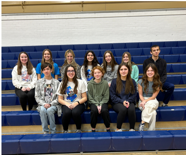
Math Club members posing for a group photo for the yearbook