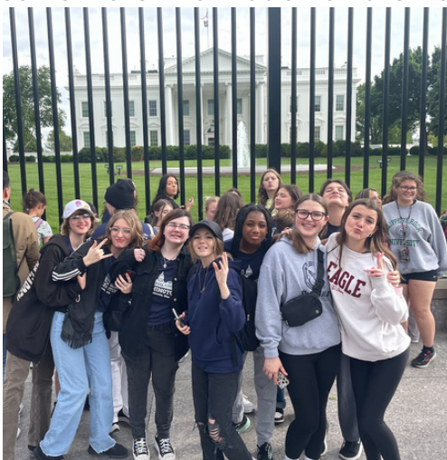
The 8th grade students last year having fun while on the DC trip

Many people have their own opinions and concerns about these trips, but all groups agree that the DC and New York City trips will be a great experience for students. Hopefully, both the DC trip and the New York City trip will be very successful!