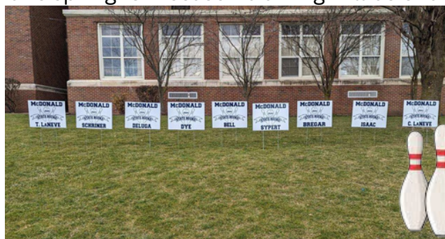
The signs outside of the school to support the boy's bowling team